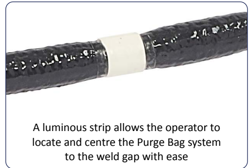
A luminous strip allows the operator to locate and centre the Purge Bag system to the weld gap with ease

Due to the design of this system, the volume of gas used to purge is minimized, resulting in significant reduction of both time and inert gas consumption. Return on investment can be achieved in as little as just one or two welds. These robust systems can be used over and over again paying for themselves in very little time.