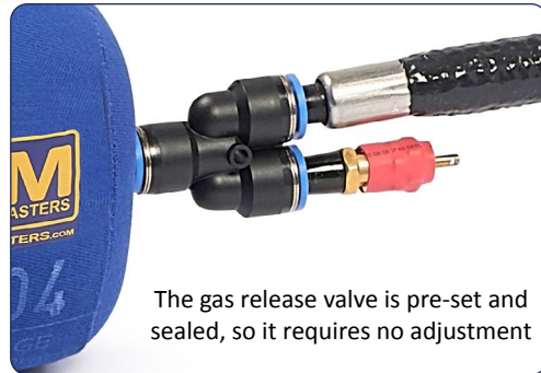
The gas release valve is pre-set and sealed, so it requires no adjustment