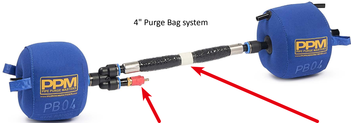
4" Purge Bag system

Used for 90% of the traditional pipe weld purging applications to provide bright, shiny, oxide free weld roots. The PPM Purge Bag system is quick and easy to use, providing a very rapid weld purge. High quality materials are used in the production of these systems, guaranteeing perfect oxide-free weld roots in very little time.